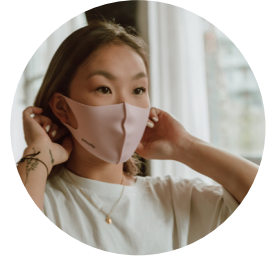
INDOOR AIR POLLUTION